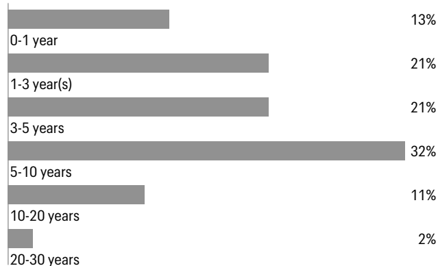
EFFECTIVE MATURITY DISTRIBUTION AS OF JUNE 30, 2023 1

1 Figures represent the percentage of the Fund's long-term investments. Allocations are subject to change and may have changed since the date specified.